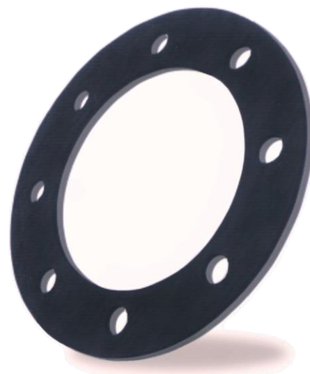
Colour - Black

Manufacturers and distributors of sealing and Jointing Materials